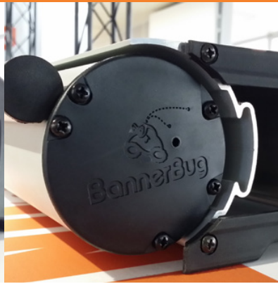
SLIDE CAP OUT TO EXPOSE THE SWAP TUBE