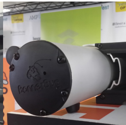
ENSURE THE BLACK FEET AT THE BOTTOM