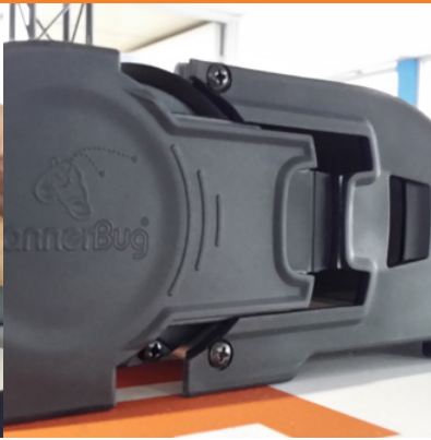
SLIDE END CAP OUT