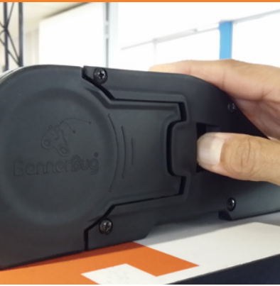
PRESS HERE TO RELEASE THE END CAP