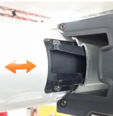
SLIDE ALL THE WAY OUT