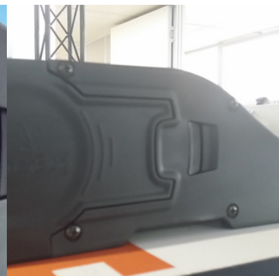
KEEP PUSHING UNTIL THE END CAP CLICKS INTO PLACE AND YOUR DONE