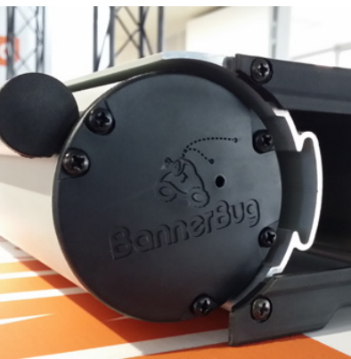
PUSH SWAP TUBE ALL THE WAY INTO THE FRAME