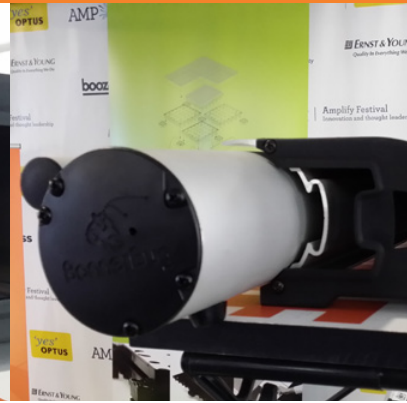
SLIDE SWAP TUBE OUT