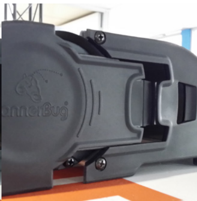
SLIDE CAP BACK INTO THE SIDE PLATE