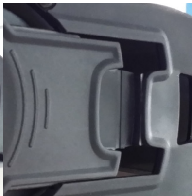
ENSURE CAP RUNNERS SLIDE INTO THE CHANNELS